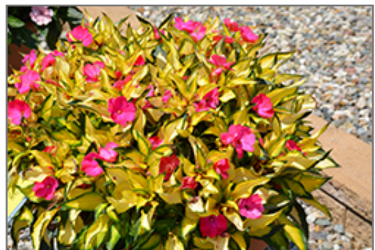
SunPatiens Compact Tropical Rose New Guinea Impatiens in bloom