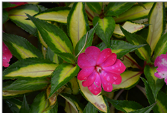
SunPatiens Compact Tropical Rose New Guinea Impatiens flowers