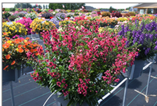
Archangel Cherry Red Angelonia in bloom