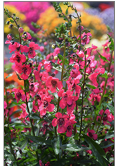
Archangel Cherry Red Angelonia flowers

Archangel Cherry Red Angelonia is a fine choice for the garden, but it is also a good selection for planting in outdoor containers and hanging baskets. It is often used as a 'filler' in the 'spiller-thriller-filler' container combination, providing a mass of flowers against which the larger thriller plants stand out. Note that when growing plants in outdoor containers and baskets, they may require more frequent waterings than they would in the yard or garden.