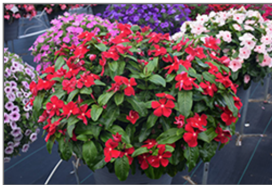
Titan Really Red Vinca in bloom