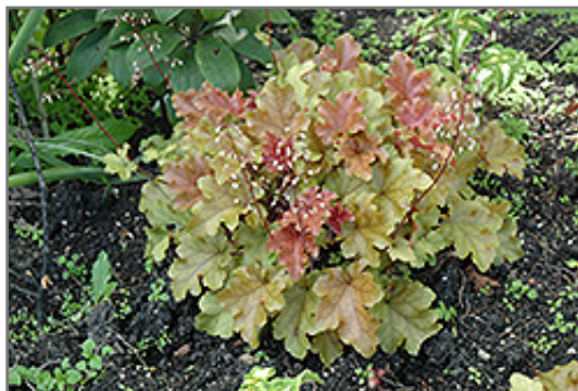
Amber Waves Coral Bells in bloom