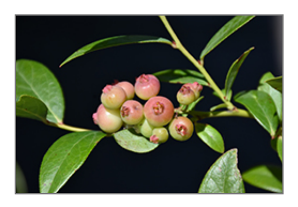
Pink Lemonade Blueberry fruit