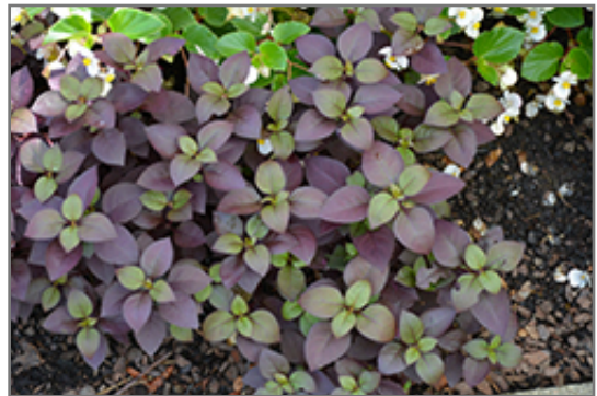
Purple Prince Alternanthera foliage