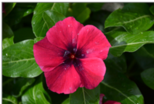
Tattoo Black Cherry Vinca flowers

This plant will require occasional maintenance and upkeep, and should not require much pruning, except when necessary, such as to remove dieback. It is a good choice for attracting butterflies to your yard, but is not particularly attractive to deer who tend to leave it alone in favor of tastier treats. It has no significant negative characteristics.