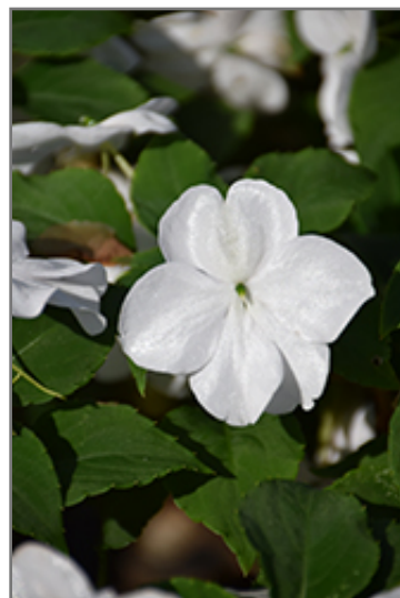
Beacon White Impatiens flowers

Beacon White Impatiens is recommended for the following landscape applications;