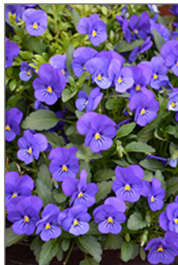
Sorbet True Blue Pansy flowers