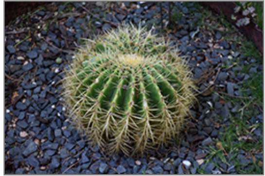
Golden Barrel Cactus

Golden Barrel Cactus is a succulent evergreen plant. It is a member of the cactus family, which are grown primarily for their characteristic shapes, their interesting features and textures, and their high tolerance for hot, dry growing environments. Like all cacti, it doesn't actually have leaves, but rather modified succulent stems that comprise the bulk of the plant, and which are designed to hold water for long periods of time. This particular cactus is valued for its distinctive barrel shape, and usually grows as a single spiny ribbed green stem. This plant has yellow cup-shaped flowers held atop the stems from late spring to early summer, which are interesting on close inspection.