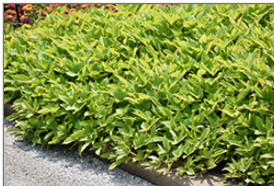
SolarPower Lime Heart Sweet Potato Vine