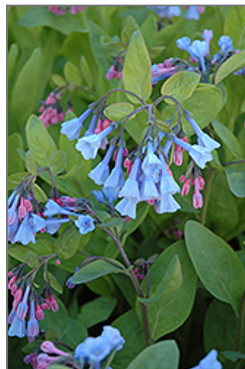
Virginia Bluebells flowers