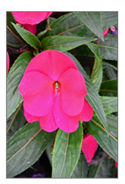
Sonic Deep Purple New Guinea Impatiens flowers