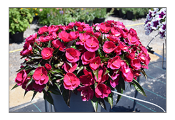
Sonic Deep Purple New Guinea Impatiens in bloom

Sonic Deep Purple New Guinea Impatiens will grow to be about 12 inches tall at maturity, with a spread of 12 inches. When grown in masses or used as a bedding plant, individual plants should be spaced approximately 10 inches apart. Its foliage tends to remain dense right to the ground, not requiring facer plants in front. This fast-growing annual will normally live for one full growing season, needing replacement the following year.