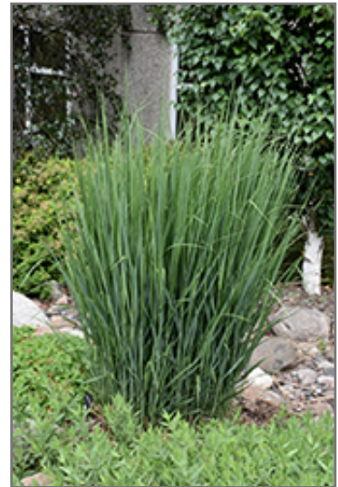
Northwind Switch Grass