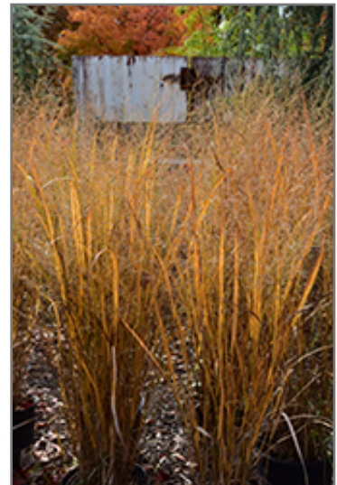
Northwind Switch Grass in fall