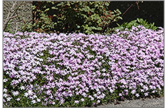
Emerald Blue Moss Phlox in bloom

This plant does best in full sun to partial shade. It prefers dry to average moisture levels with very well-drained soil, and will often die in standing water. It is considered to be drought-tolerant, and thus makes an ideal choice for a low-water garden or xeriscape application. It is not particular as to soil type, but has a definite preference for alkaline soils. It is highly tolerant of urban pollution and will even thrive in inner city environments. Consider covering it with a thick layer of mulch in winter to protect it in exposed locations or colder microclimates. This is a selection of a native North American species. It can be propagated by division; however, as a cultivated variety, be aware that it may be subject to certain restrictions or prohibitions on propagation.