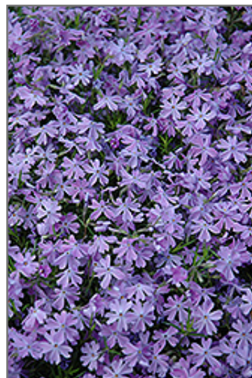
Emerald Blue Moss Phlox flowers