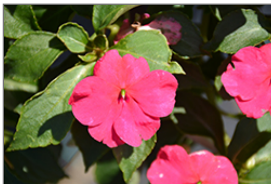
Beacon Rose Impatiens flowers