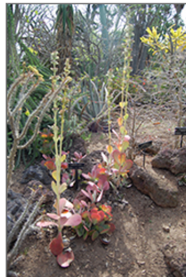
Paddle Plant in bloom