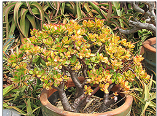
Sunset Jade Plant