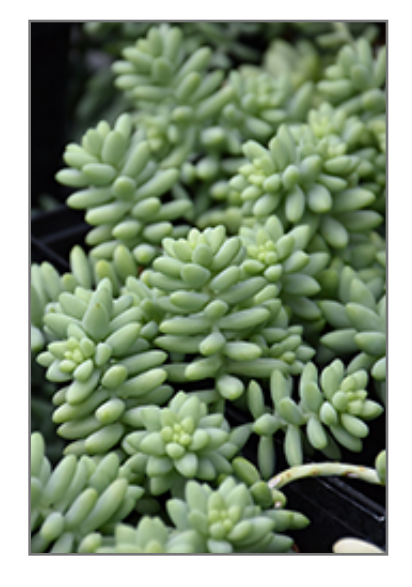
Burrito Stonecrop foliage