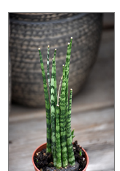
Mikado Cylindrical Snake Plant

When grown indoors, Mikado Cylindrical Snake Plant can be expected to grow to be about 3 feet tall at maturity, with a spread of 18 inches. It grows at a slow rate, and under ideal conditions can be expected to live for approximately 10 years. This houseplant will do well in a location that gets either direct or indirect sunlight, although it will usually require a more brightly-lit environment than what artificial indoor lighting alone can provide. It prefers dry to average moisture levels with very well-drained soil, and may die if left in standing water for any length of time. This plant should be watered when the surface of the soil gets dry, and will need watering approximately once each week. Be aware that your particular watering schedule may vary depending on its location in the room, the pot size, plant size and other conditions; if in doubt, ask one of our experts in the store for advice. It is not particular as to soil pH, but grows best in sandy soil. Contact the store for specific recommendations on pre-mixed potting soil for this plant. Be warned that parts of this plant are known to be toxic to humans and animals, so special care should be exercised if growing it around children and pets.