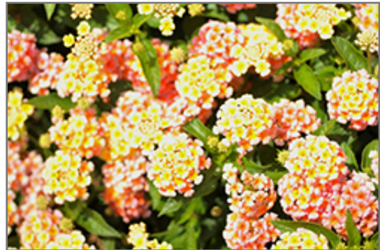
Lucky Peach Lantana flowers

Lucky Peach Lantana is recommended for the following landscape applications;