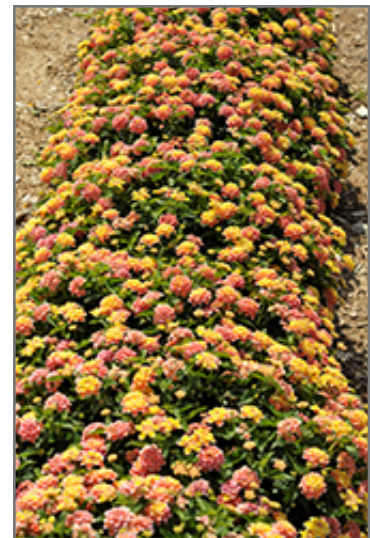
Lucky Peach Lantana in bloom