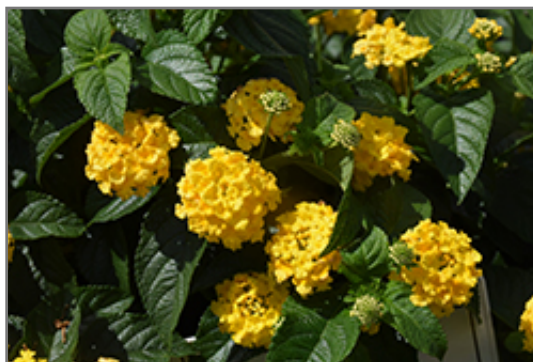
Lucky Yellow Lantana flowers

Lucky Yellow Lantana is recommended for the following landscape applications;