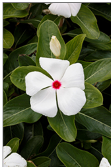
Cora Cascade Polka Dot Vinca flowers

Cora Cascade Polka Dot Vinca is recommended for the following landscape applications;