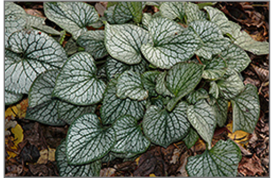
Jack Frost Bugloss foliage

Jack Frost Bugloss is recommended for the following landscape applications;