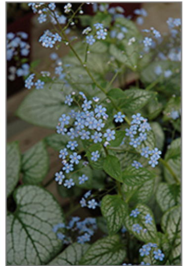
Jack Frost Bugloss flowers