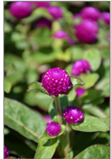
Gnome Purple Gomphrena flowers

Gnome Purple Gomphrena is recommended for the following landscape applications;