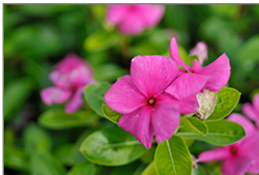
Pacifica XP Lilac Vinca flowers

This plant will require occasional maintenance and upkeep, and should not require much pruning, except when necessary, such as to remove dieback. It is a good choice for attracting butterflies to your yard, but is not particularly attractive to deer who tend to leave it alone in favor of tastier treats. It has no significant negative characteristics.