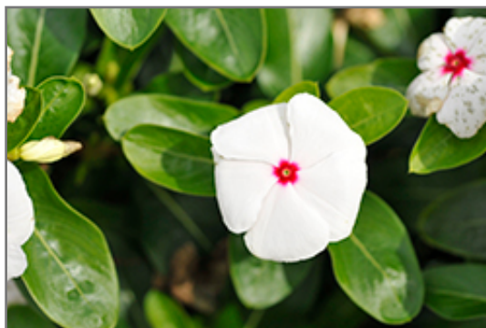
Pacifica XP Polka Dot Vinca flowers

This plant will require occasional maintenance and upkeep, and should not require much pruning, except when necessary, such as to remove dieback. It is a good choice for attracting butterflies to your yard, but is not particularly attractive to deer who tend to leave it alone in favor of tastier treats. It has no significant negative characteristics.