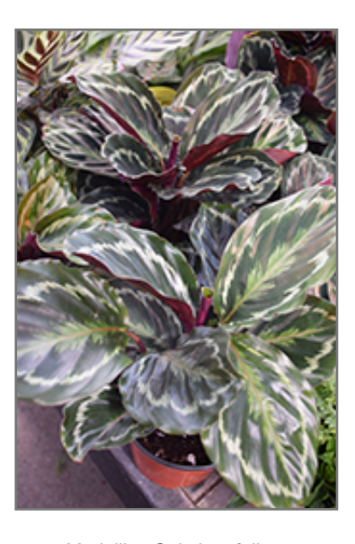
Medallion Calathea foliage

When grown indoors, Medallion Calathea can be expected to grow to be about 30 inches tall at maturity, with a spread of 24 inches. It grows at a slow rate, and under ideal conditions can be expected to live for approximately 5 years. This houseplant performs well in both bright or indirect sunlight and strong artificial light, and can therefore be situated in almost any well-lit room or location. It does best in average to evenly moist soil, but will not tolerate standing water. The surface of the soil shouldn't be allowed to dry out completely, and so you should expect to water this plant once and possibly even twice each week. Be aware that your particular watering schedule may vary depending on its location in the room, the pot size, plant size and other conditions; if in doubt, ask one of our experts in the store for advice. It will benefit from a regular feeding with a general-purpose fertilizer with every second or third watering. It is not particular as to soil pH, but grows best in rich soil. Contact the store for specific recommendations on pre-mixed potting soil for this plant.