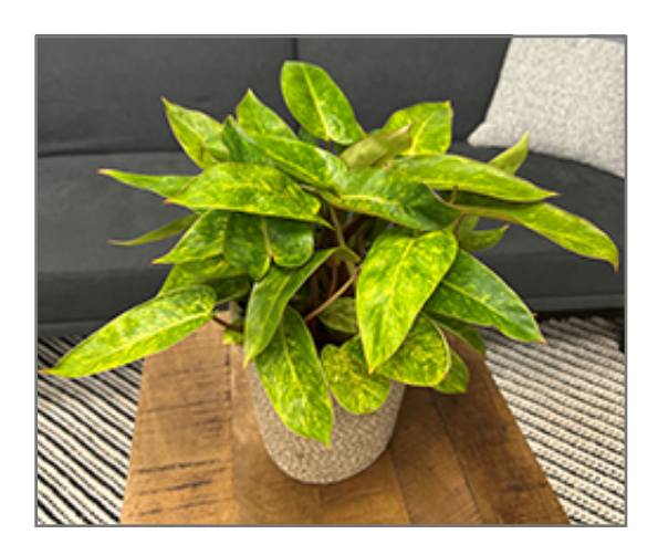
Prismacolor Painted Lady Variegated Climbing Philodendron in full

Prismacolor Painted Lady Variegated Climbing Philodendron's attractive glossy heart-shaped leaves emerge yellow, turning lime green in color with showy chartreuse variegation throughout the year on a plant with an upright spreading habit of growth.