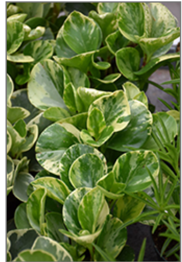
Golden Gate Baby Rubber Plant foliage

This is an herbaceous evergreen houseplant with an upright spreading habit of growth. This plant should not require much pruning, except when necessary to keep it looking its best.