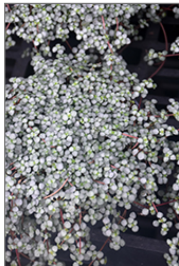
Aquamarine Pilea foliage