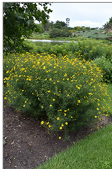
Tickseed in bloom