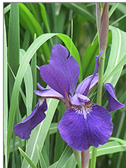
Caesar's Brother Siberian Iris flowers