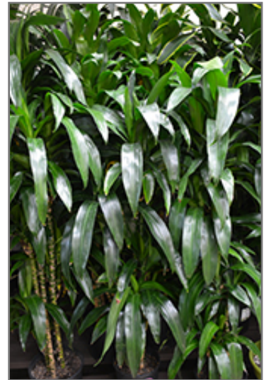
Lisa Dracaena foliage

When grown indoors, Lisa Dracaena can be expected to grow to be about 5 feet tall at maturity, with a spread of 24 inches. It grows at a medium rate, and under ideal conditions can be expected to live for approximately 10 years. This houseplant performs well in both bright or indirect sunlight and strong artificial light, and can therefore be situated in almost any well-lit room or location. It does best in average to evenly moist soil, but will not tolerate standing water. The surface of the soil shouldn't be allowed to dry out completely, and so you should expect to water this plant once and possibly even twice each week. Be aware that your particular watering schedule may vary depending on its location in the room, the pot size, plant size and other conditions; if in doubt, ask one of our experts in the store for advice. It will benefit from a regular feeding with a general-purpose fertilizer with every second or third watering. It is not particular as to soil type or pH; an average potting soil should work just fine.