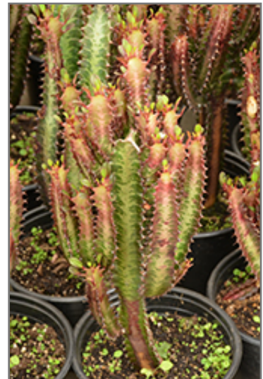
Rubra African Milk Tree in full