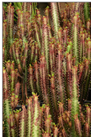
Rubra African Milk Tree stems

When grown indoors, Rubra African Milk Tree can be expected to grow to be about 9 feet tall at maturity, with a spread of 4 feet. It grows at a medium rate, and under ideal conditions can be expected to live for approximately 60 years. This houseplant will do well in a location that gets either direct or indirect sunlight, although it will usually require a more brightly-lit environment than what artificial indoor lighting alone can provide. It does best in average soil that is neither too wet nor too dry, and may die if left in standing water for any length of time. This plant should be watered when the surface of the soil gets dry, and will need watering approximately once each week. Be aware that your particular watering schedule may vary depending on its location in the room, the pot size, plant size and other conditions; if in doubt, ask one of our experts in the store for advice. Like most succulents and cacti, it prefers to grow in poor soils and should therefore never be fertilized. It is not particular as to soil pH, but grows best in sandy soil. Contact the store for specific recommendations on pre-mixed potting soil for this plant. Be warned that parts of this plant are known to be toxic to humans and animals, so special care should be exercised if growing it around children and pets.