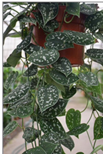
Argyraeus Pothos foliage