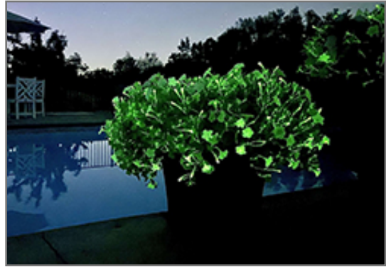
Firefly Petunia flowers

Firefly Petunia will grow to be about 10 inches tall at maturity, with a spread of 10 inches. When grown in masses or used as a bedding plant, individual plants should be spaced approximately 10 inches apart. Its foliage tends to remain low and dense right to the ground. This fast-growing annual will normally live for one full growing season, needing replacement the following year.