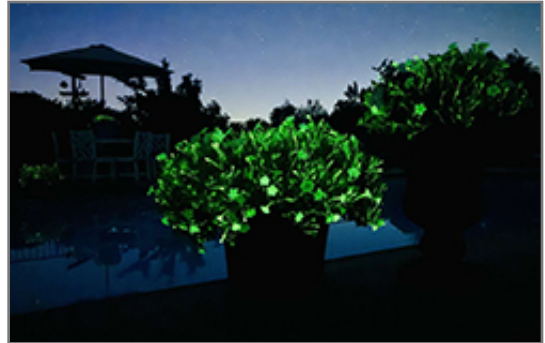
Firefly Petunia flowers

Firefly Petunia is recommended for the following landscape applications;