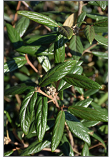
Prague Viburnum foliage

This shrub does best in full sun to partial shade. It prefers to grow in average to moist conditions, and shouldn't be allowed to dry out. It is not particular as to soil type or pH. It is highly tolerant of urban pollution and will even thrive in inner city environments. This particular variety is an interspecific hybrid.