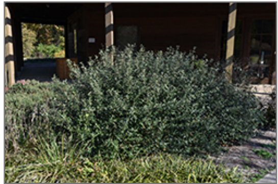
Prague Viburnum