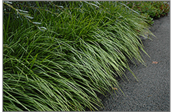
Lily Turf

Lily Turf will grow to be about 12 inches tall at maturity extending to 16 inches tall with the flowers, with a spread of 24 inches. Its foliage tends to remain dense right to the ground, not requiring facer plants in front. It grows at a fast rate, and under ideal conditions can be expected to live for approximately 10 years. As an herbaceous perennial, this plant will usually die back to the crown each winter, and will regrow from the base each spring. Be careful not to disturb the crown in late winter when it may not be readily seen!