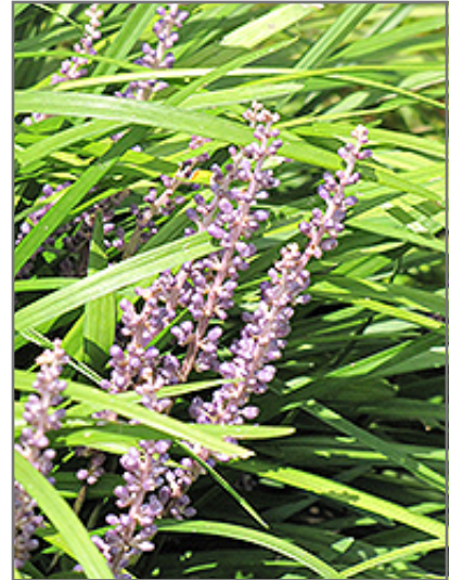
Lily Turf flowers