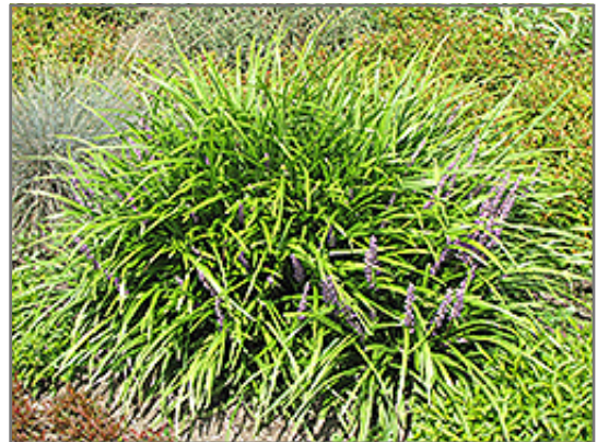
Lily Turf in bloom