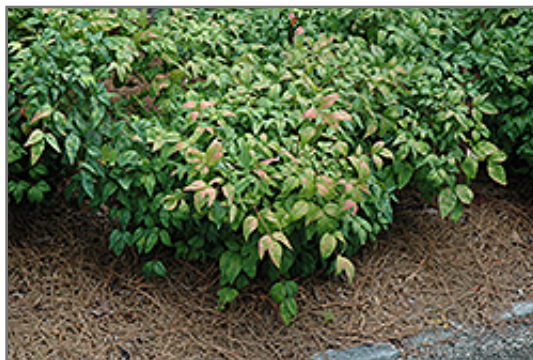
Fire Power Nandina