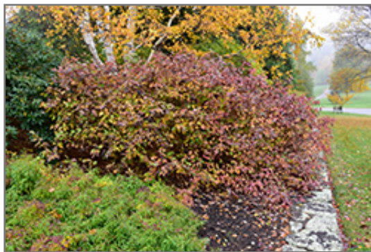
Bailey Red-Twig Dogwood in fall