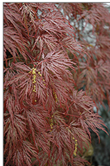
Inaba Shidare Cutleaf Japanese Maple foliage

Inaba Shidare Cutleaf Japanese Maple is recommended for the following landscape applications;