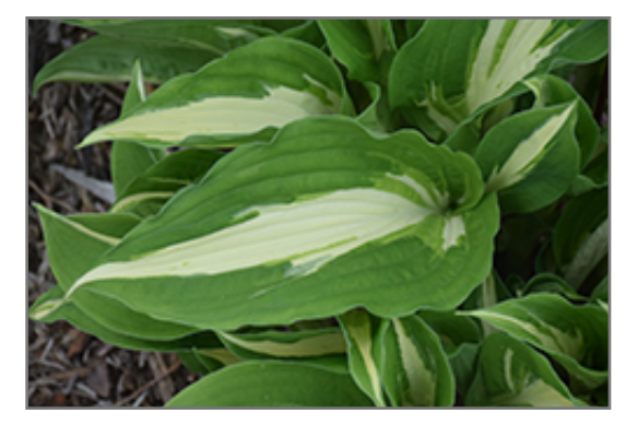
Night Before Christmas Hosta foliage