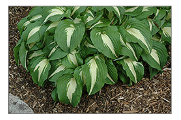
Night Before Christmas Hosta foliage