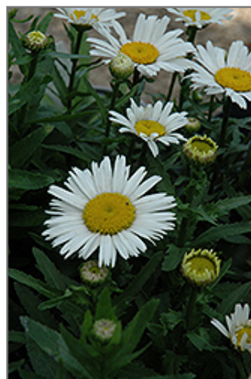
Snow Lady Shasta Daisy flowers

Snow Lady Shasta Daisy is recommended for the following landscape applications;