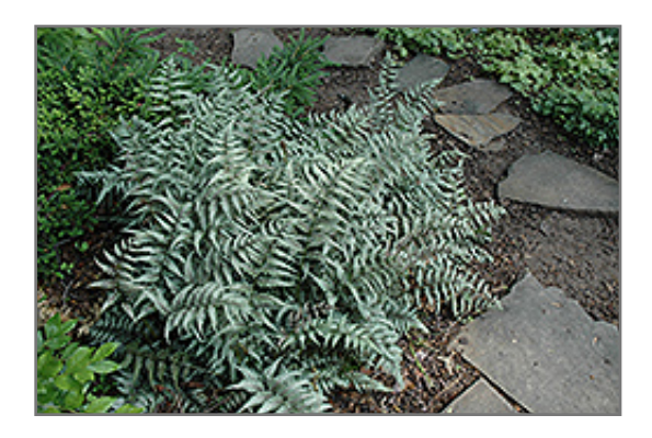
Japanese Painted Fern