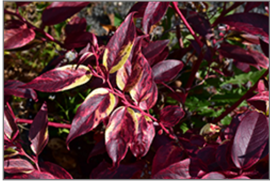
Rainbow Fetterbush in fall

Rainbow Fetterbush makes a fine choice for the outdoor landscape, but it is also well-suited for use in outdoor pots and containers. Because of its height, it is often used as a 'thriller' in the 'spiller-thriller-filler' container combination; plant it near the center of the pot, surrounded by smaller plants and those that spill over the edges. It is even sizeable enough that it can be grown alone in a suitable container. Note that when grown in a container, it may not perform exactly as indicated on the tag - this is to be expected. Also note that when growing plants in outdoor containers and baskets, they may require more frequent waterings than they would in the yard or garden.