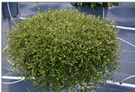
Wire Vine