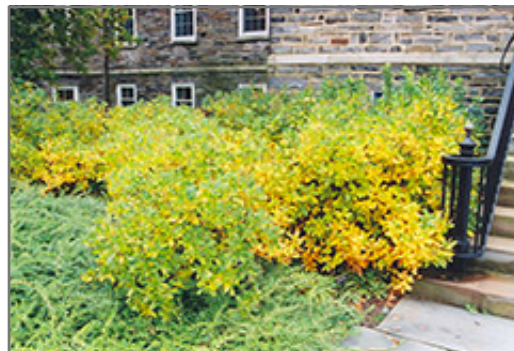
Summersweet in fall