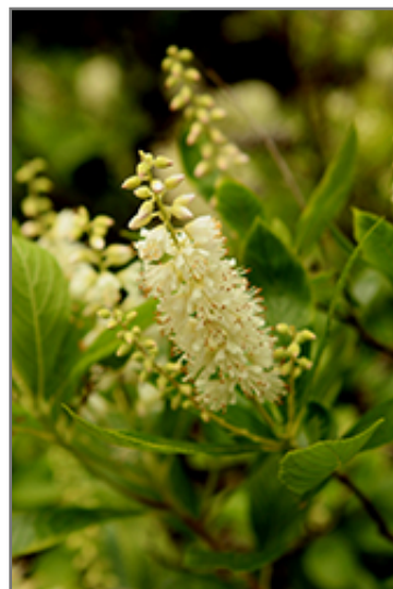
Summersweet flowers

Summersweet is recommended for the following landscape applications;