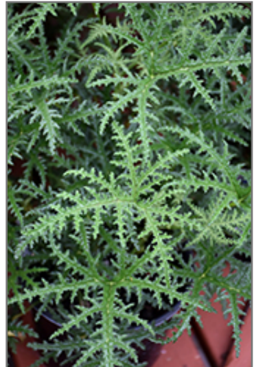
Pine Scented Geranium foliage